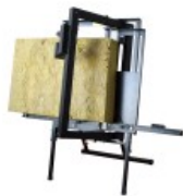
Formes de coupes possibles :