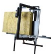
Formes de coupes possibles :